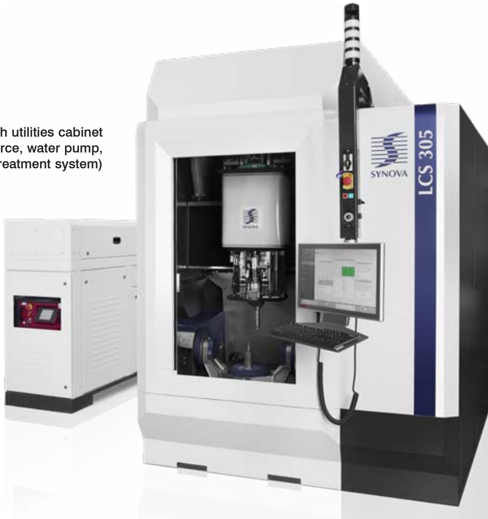
LCS 305 with utilities cabinet (incl. laser source, water pump, water treatment system)