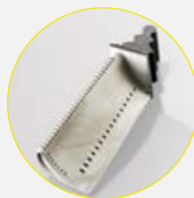
Aerospace Hole-drilling of turbine blades