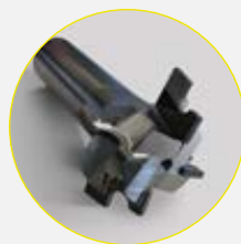
Tool Manufacturing 3D cutting of rotation tools