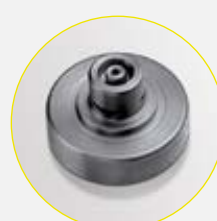
Automotive Machining of automotive parts