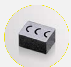
Micro-Machining 3D cutting of precision parts