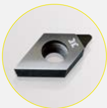
Tool Manufacturing Shaping of tool inserts