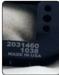
Blackened Steel Marked