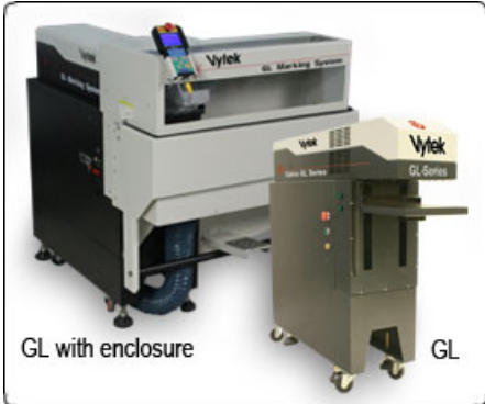
GL with enclosure

The Vytek Laser GL series is a self standing compact and integrated laser system designed as a class 4 device or with an optional enclosure. The GL series is often chosen when a specific marking or small field cutting use is required to fit in a production environment. The GL is also portable system so it can serve as a mobile marking or cutting