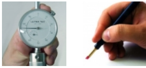
Protrusion Gauge Cleave & Scribe