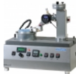
ULTRAPOL Fiberlab Module System