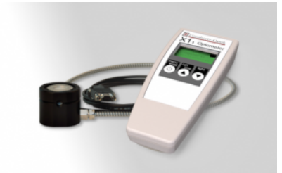
Mobile UV radiometer with separate measuring device and detector for measuring the irradiance and dose of germicidal mercury lamps.