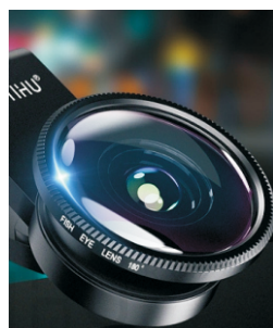
Mobile phone camera