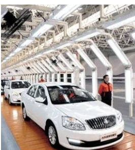
Car light source room

T6020-X light source room Lighting source is suitable for many industry lighting places, such as: laboratories, standardized workshops, automotive light source rooms, experimental bases, etc.